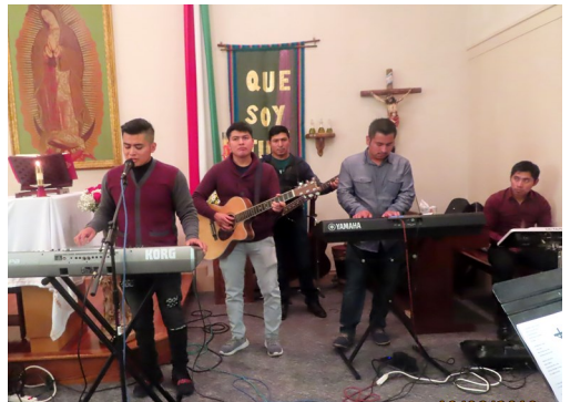
Young musicians purchase their own instruments to form this group for liturgy