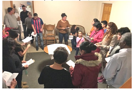
Novena to Our Lady of Guadalupe (Heberle Camp)