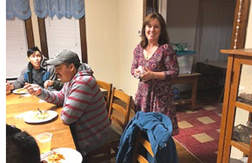
Volunteer, cooks monthly for farmworkers (Geneva)