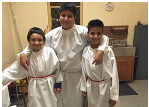
New Altar Services (Geneva)