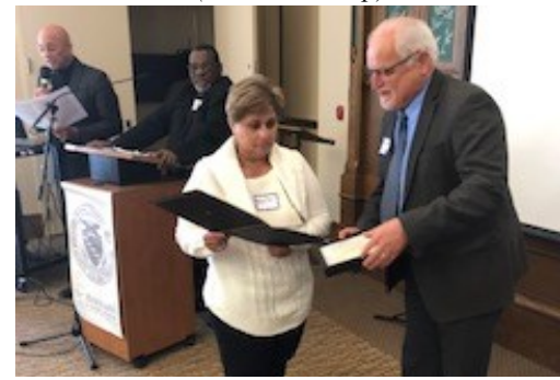
Diocesan Volunteer (Geneva) Recognition at Hispanic Leadership Conference